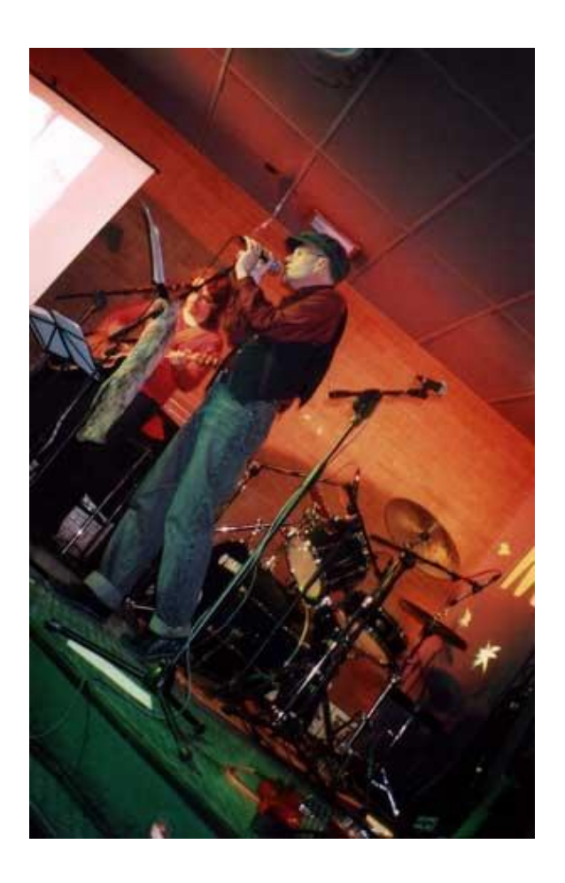
TAN FIERO TAN FRÁGIL. 2003

Tonight's last song The last drink I want to make a toast to the weary that went away to the wild where the flowers grow up free Tell me how is it going with your life If the rain goes with your steps or someone embraces your changing dreams Conscience was in danger and so were our emotions May not be in vain When the breeze caresses your skin remember this song How the music was caressing your body while my voice faded out.